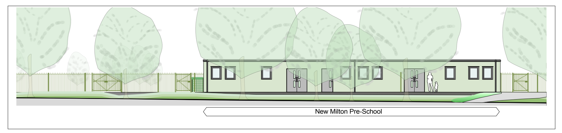
Proposed North West Elevation - New Milton Pre-School